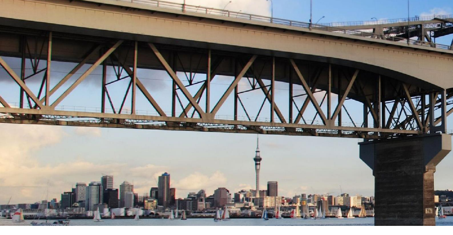
Within 5 – 10 kilometres from Auckland CBD