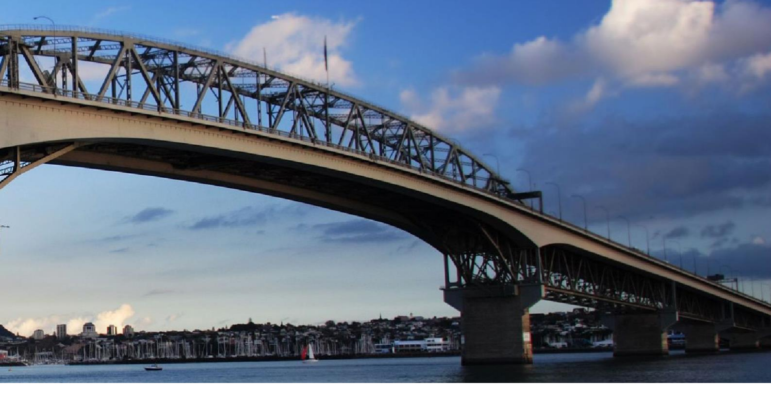
Within 10 – 15 kilometres from Auckland CBD